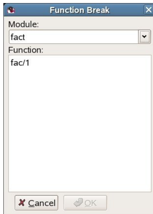
Figure 2.3: Function Break Dialog Window

A function breakpoint is a set of line breakpoints, one at the first line of each clause in the specified function.